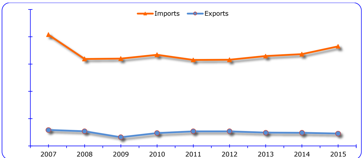
Figure 6: Trade Balance, in Value Terms, 2007-2015 (million EUR), in import/export prices